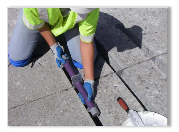
Figure 2. Inserting dowel bar assembly into slot (Photo courtesy of Jeff Uhlmeyer, Washington State DOT).